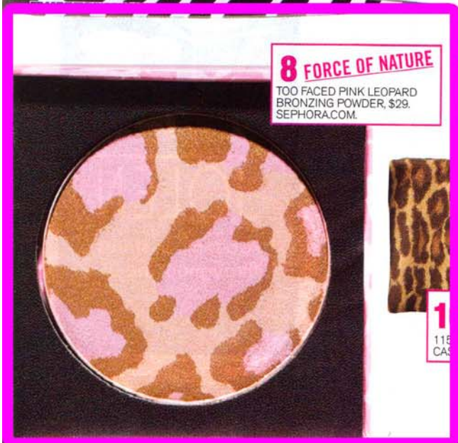
8 FORCE OF NATURE TOO FACED PINK LEOPARD BRONZING POWDER, $29. SEPHORA.COM.

Take a walk on the wild side with these jungle-inspired goods.