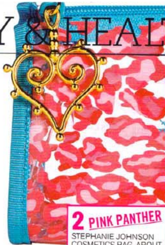
2 PINK PANTHER STEPHANIE JOHNSON COSMETICS BAG, ABOUT $22. SLEEPYHEADS.COM.