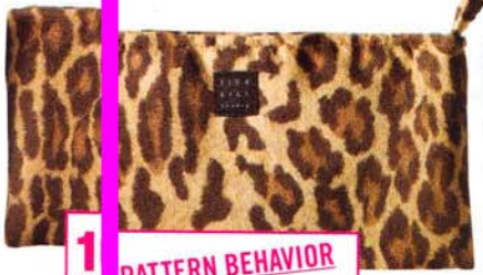
10 PATTERN BEHAVIOR L. STUDIO ANNE COSMETICS ABOUT $36. 1154LILL.COM.

Clockwise from top left: D&G, Rigaud, Stephanie Johnson, Too Faced, Maria B., Tweezerman, Studio Anne Cosmetics, France No. 9