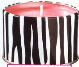
1 SMOKE SIGNALS RIGAUD PARIS TRAVEL TIN CANDLE IN SANTIFOLIA, $25. NEIMAN MARCUS.