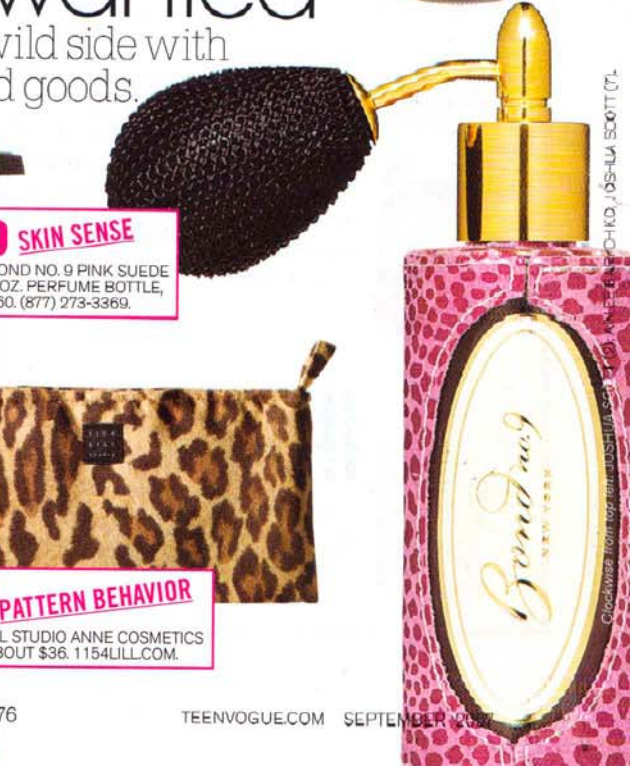
9 SKIN SENSE FRANCE NO. 9 PINK SUEDE 1.0 FL. OZ. PERFUME BOTTLE, $0. (877) 273-3369.