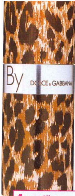
4 SPOT ON BY DOLCE & GABBANA WOMAN EAU DE TOILETTE, $70 FOR 1.7 OZ. (888) 219-2888.