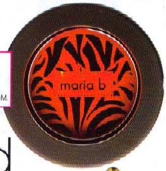
6 RED ALERT MARIA B. LIP PAINT IN LOVE SCANDAL, $16. MARIABCOSMETICS.COM